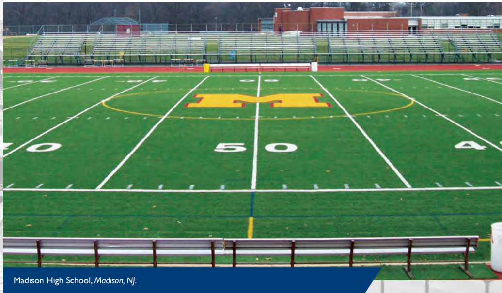
Madison High School, Madison, NJ.

All of this ensures your PowerBlade HP synthetic turf system will maintain its natural look, amazing softness and high-performance year after year.